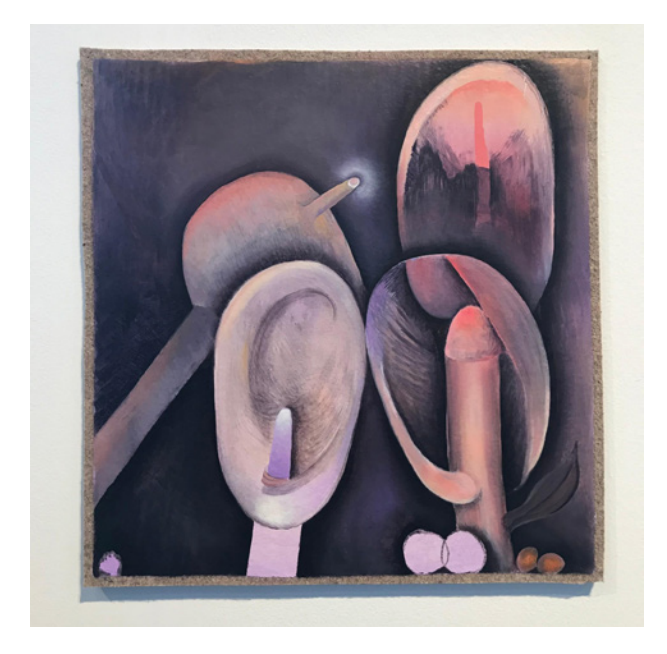
Santiago de Paoli (Argentina), First meeting, 2020. Oil on felt fabric. 51 \times 49 cm.

Santiago de Paoli paints moons, candles, lamps, human posteriors, genitalia, flowers, hearts, socks (socks?, yes socks), landscapes, and other relatively banal subject matter. In order to obviate the seriousness of the medium, de Paoli paints on singularly unusual supports which include felt, recycled textiles, as well as wood (often also recycled), and more recently, plaster. His iconographic frame of reference includes everything from Italian renaissance painting to the surrealism of Giorgio de Chirico to the thematic simplicity and obsessiveness of Giorgio Morandi as well as the antic weirdness of Philip Guston.