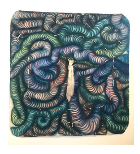
Carlos Villa (United States), Ritual, 1970. Wig, chicken bones, canvas. 101 \times 95 in (256.54 \times 241.3 \text{ cm}) .

Born in 1936 in San Francisco, Carlos Villa created works that prompted a dialogue between the history of Filipino art and western art history. This contributed greatly to the zeitgeist of artistic multiculturalism in the Bay Area in the 1970s. Villa configured multi-media projects and performances that he called "Actions," which were often group collaborations touching on the idea of multicultural subjectivity. He liberally experimented with material, overcoming artificial contradictions between minimalist tendencies and abstract expressionist gestures.